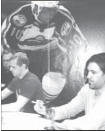
Minnesota Wild forwards Marian Gaborik (left) and Brian Rolston greeted fans and signed autographs last year during the Let's Play Hockey Expo.