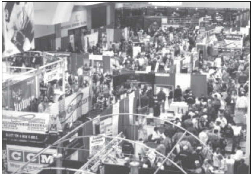
Record-setting crowds attended last year's Let's Play Hockey Expo at the RiverCentre in St. Paul, Minnesota.

Largest Consumer Hockey Show in the World!